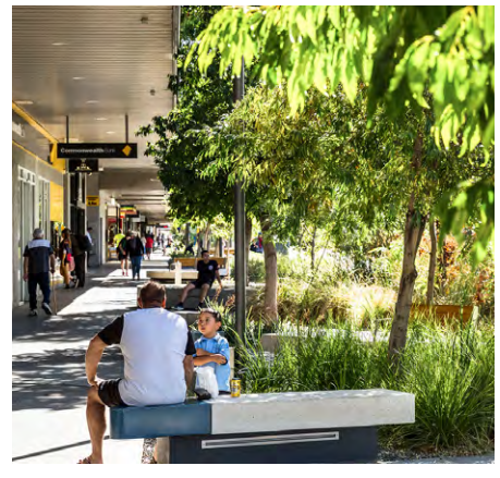
Malop Street, Geelong - Outlines Landscape Architects (www.outlinesla.com.au)