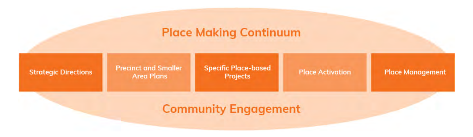
Diagram 3 – Place Making Continuum

Council's projects and activities can be seen as occurring along a 'Place Making Continuum' ranging from strategies through to more localised design projects and in some instances the activation of spaces and place management. The elements of the place making continuum help to understand how the various work across council fit together and contribute to place making, these include: