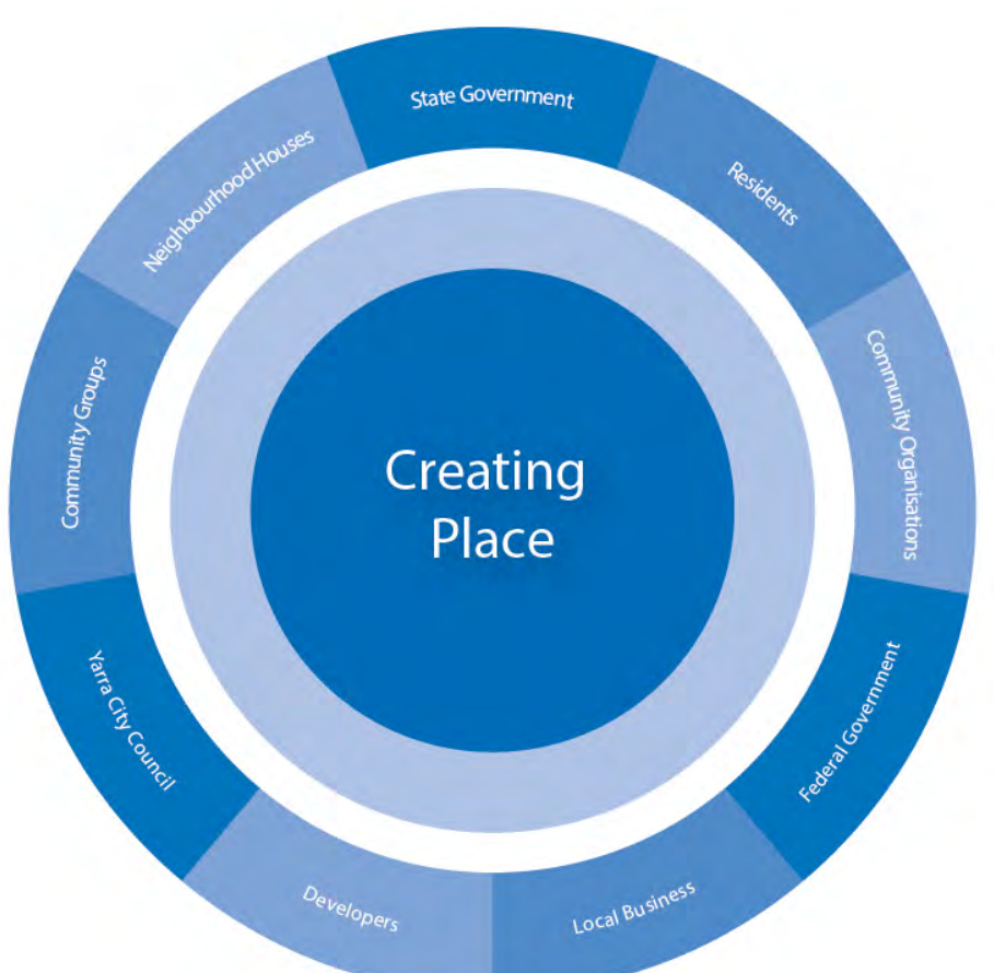
Diagram 1 – Creating Places