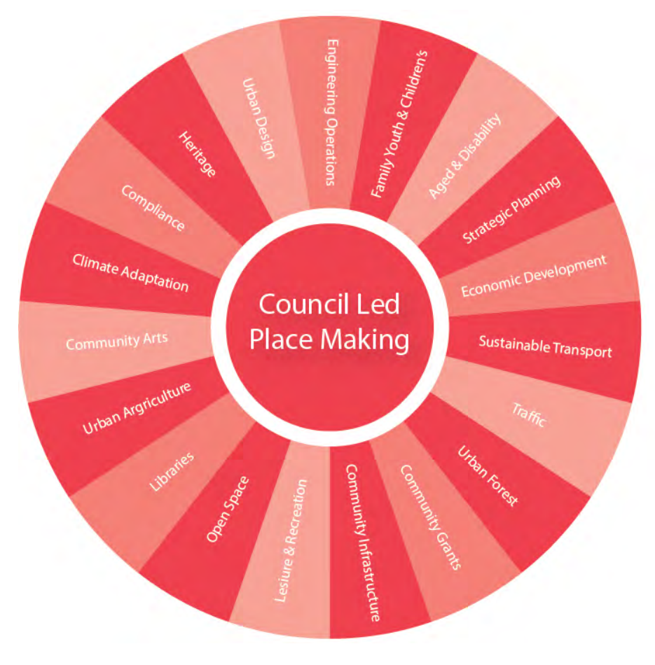
Diagram 2 - Place Making Influences at Yarra