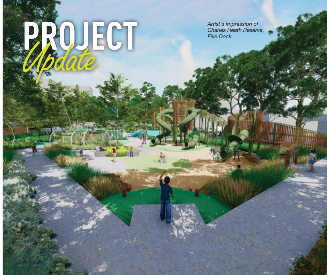
Artist's impression of Charles Heath Reserve, Five Dock.