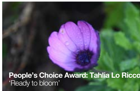
People's Choice Award: Tahlia Lo Ricco 'Ready to bloom'