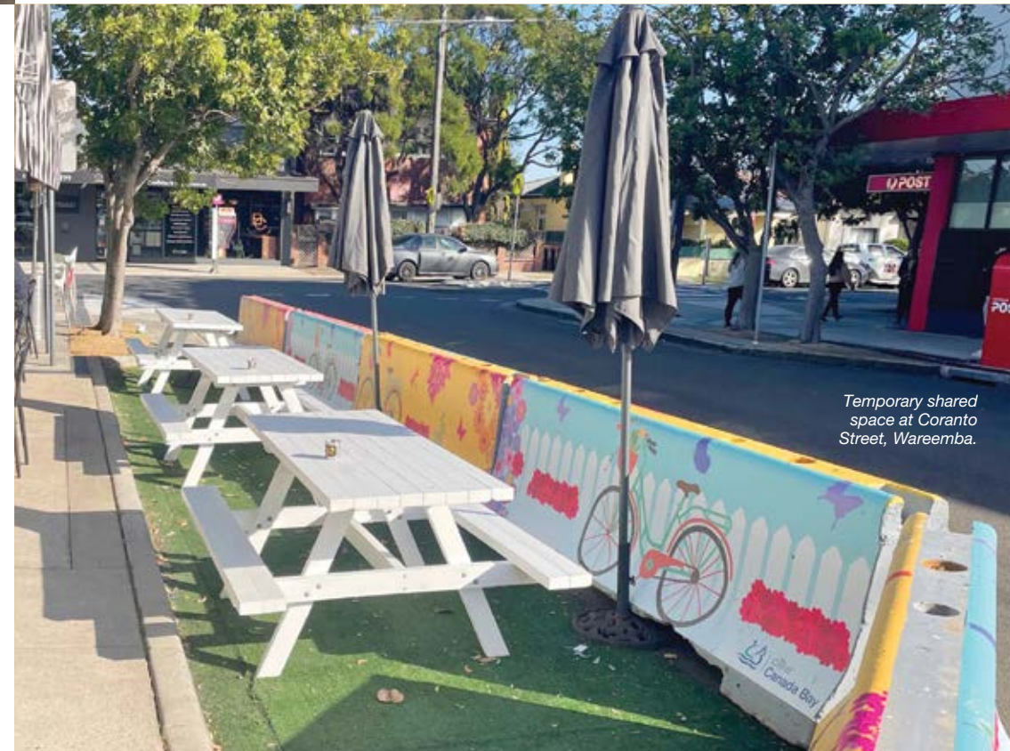
Temporary shared space at Coranto Street, Wareemba.

Since March 2019 we've been working hard to engage our community and work collaboratively to build a City we all love. Our community engagement website, Collaborate Canada Bay, has had over 500,000 views and an active community of over 8,000 members. Become a member of our engagement community at collaborate.canadabay.nsw.gov.au .