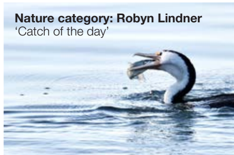
Nature category: Robyn Lindner 'Catch of the day'