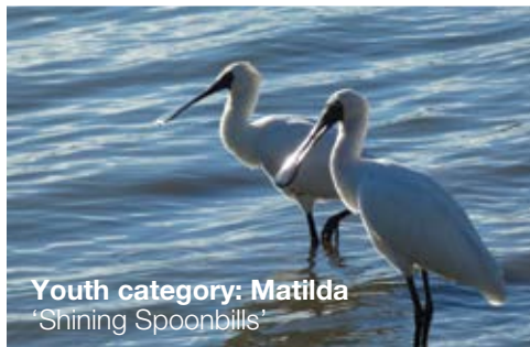
Youth category: Matilda 'Shining Spoonbills'