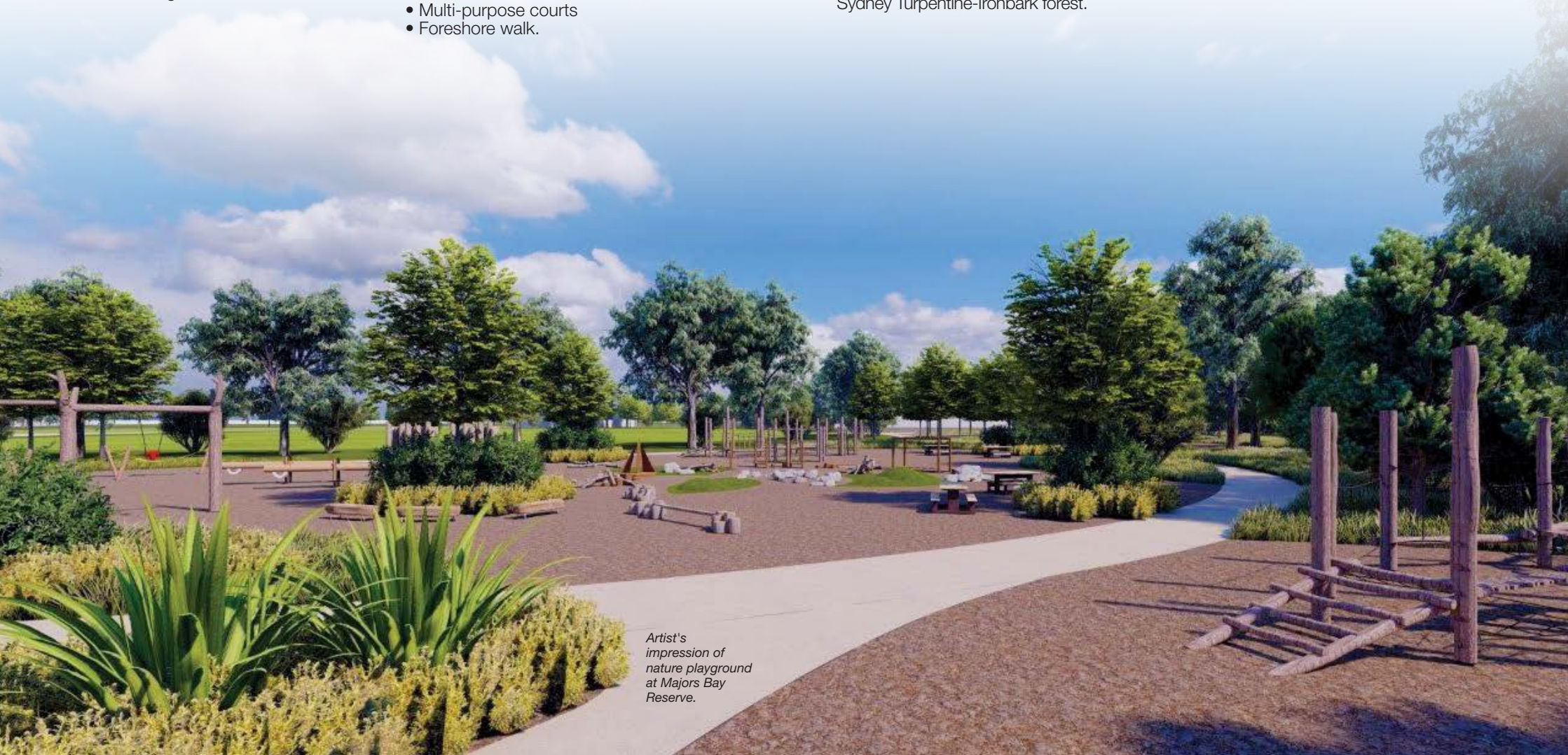
Artist's impression of nature playground at Majors Bay Reserve.

There's still time to review the detailed designs and share your feedback online at bit.ly/mbrprecinct before submissions close on 27 November 2022.